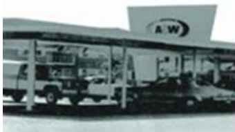
Jack Taylor's A&W Root Beer (Snyder Drugs Location)