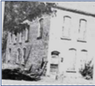
Original City Hall 1865 –1890