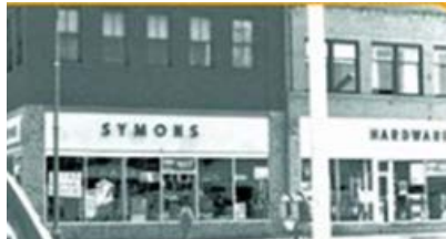
Symons Hardware (Corner of Iron and Silver)