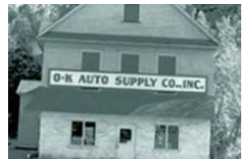
O-K Auto Parts (Houghton Law Office)