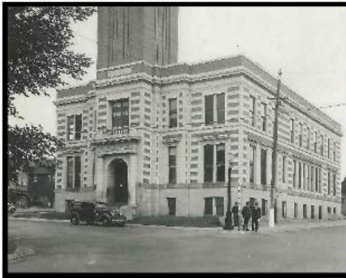
City Hall rebuilt in 1915

E. C.COOLEY Real Estate and Insurance - July 16, 1909