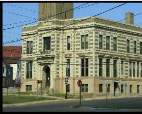
City Hall as it looks presently