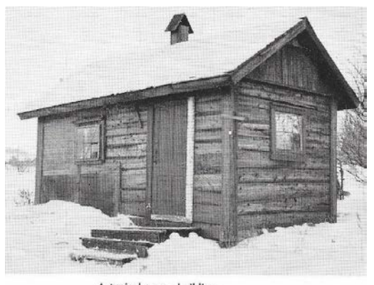
A typical sauna building

Every nationality group enjoys some particular rite or ceremony. In Finland, there are said to be over one-half million saunas. You may also enjoy a sauna in Negaunee even if you're not a Finn. The ideal 6 by 6 foot cabin size sauna is constructed as a separate log building near a creek or lake. The sauna must be airtight to get the best results from the steam. The bather gets a pail of water and a towel and prepares for the bath by pouring water on the hot stones. The purpose is to raise the temperature by spreading steam so that the body pores really open up. Normal temperatures